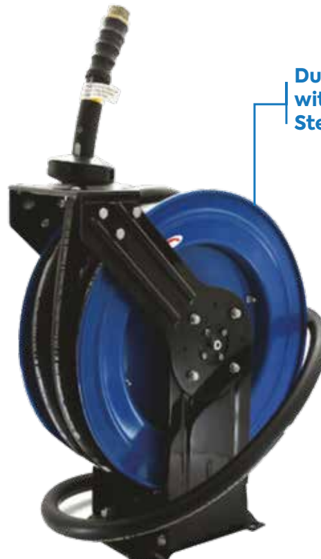
Dual Arm Air Hose Reel with 18 ga. Heavy Duty Steel Construction