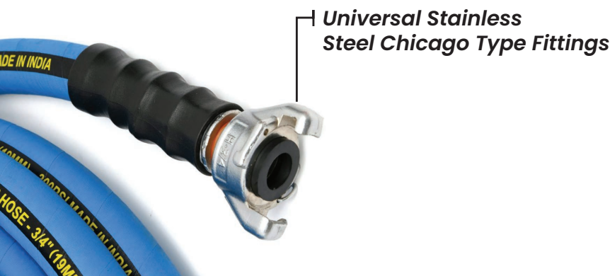
Universal Stainless Steel Chicago Type Fittings

BluBird Jack-Hammer hoses are 9lbs lighter than standard jack-hammer hoses and are stronger & more flexible. Designed to offer exceptional flexibility even in extreme conditions down to -50°F up to +190°F these hoses can be used year-round in most parts of the world. These hoses are constructed with abrasion resistant external covers and high strength polyester woven reinforcement to prevent elongation and add superior strength with a 300 PSI working pressure and 4:1 safety factor. The heavy duty wrapped finish prevents the hose from damage and wear in different applications and environments. The BluBird Jack Hammer hose features universal stainless steel chicago type fittings for longer life vs cast iron fittings.